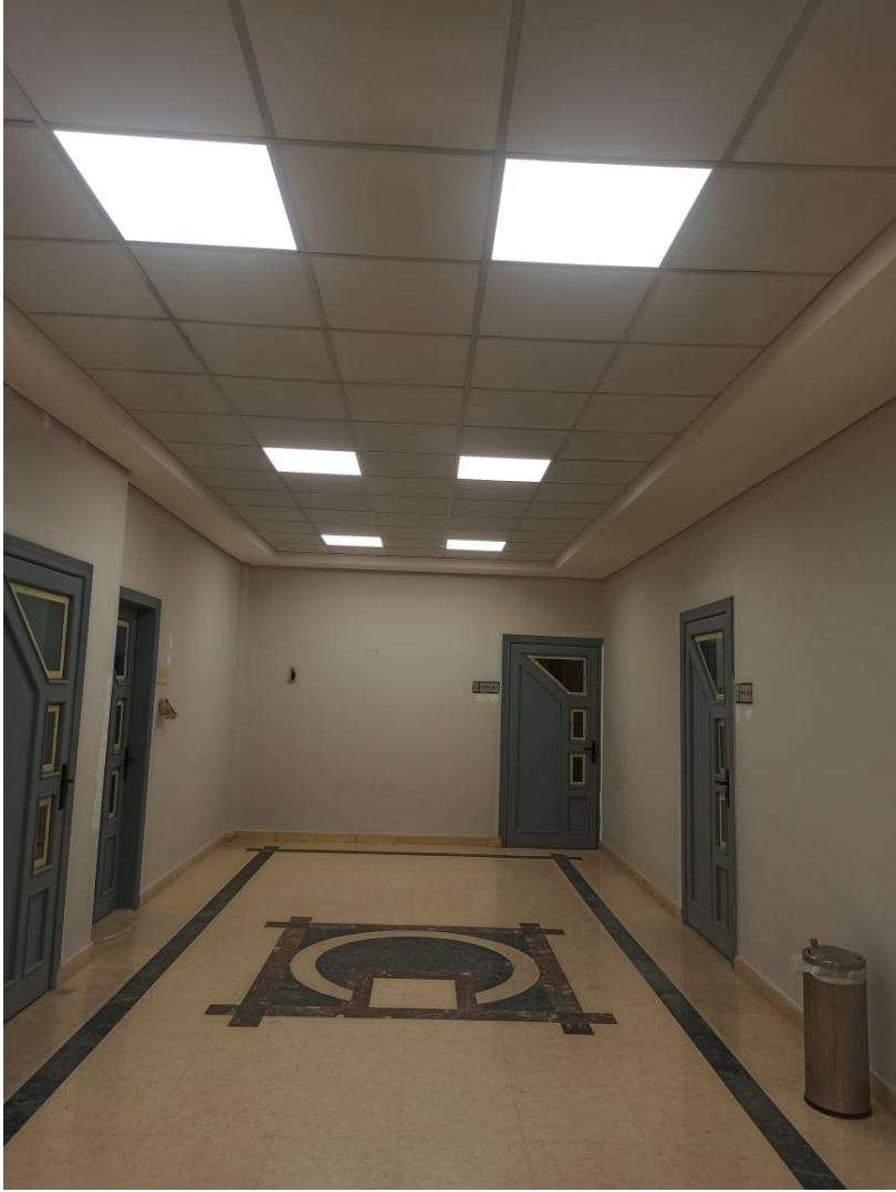
FUE replaced the less efficient lamps and bulbs with high-performance LED lamps